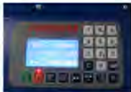
Easy to operate control panel