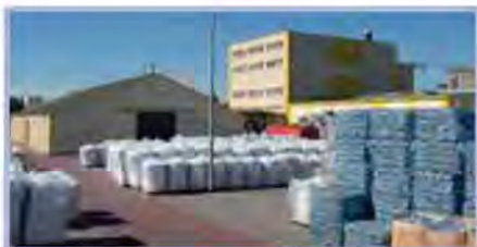
Polyester recycling plant

In its new factory the STARstrap™ Polyester strapping is being manufactured on state-of-the-art extrusion lines. These polyester plastic strappings guarantee the high quality standard of package securing and unitizing solutions using FROMM tools and automatic machines. The new production plant has been awarded the ISO 9001 and ISO 14000 certifications.