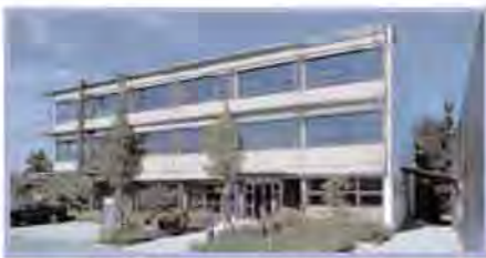
Research and development operation

Established in 1947, the family-owned business employs approximately 550 people throughout the world. 20 subsidiaries in Europe, the USA and South Africa and more than 50 specialized partners and distributors worldwide guarantee efficient customer service and assistance. Traditional values like continuity, independency and reliable quality products guide the company's corporate policy and represent the success over decades.