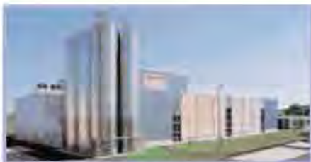
STARstrap™ manufacturing operation

In the production operation, FROMM production runs around the clock. Highly qualified teams of specialists using computer-controlled machines manufacture FROMM products designed to meet the demands for high quality. All tools and machines are tested prior to being despatched from the factory. FROMM has been awarded the ISO 9001 certification.