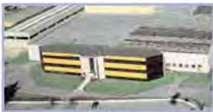
Tool and machine manufacturing

At the research center an experienced team of engineers continually develops new techniques and products using the newest 3D CAD computers. Constantly updated testing procedures and equipment guarantee and secure the recognized high FROMM quality standards.